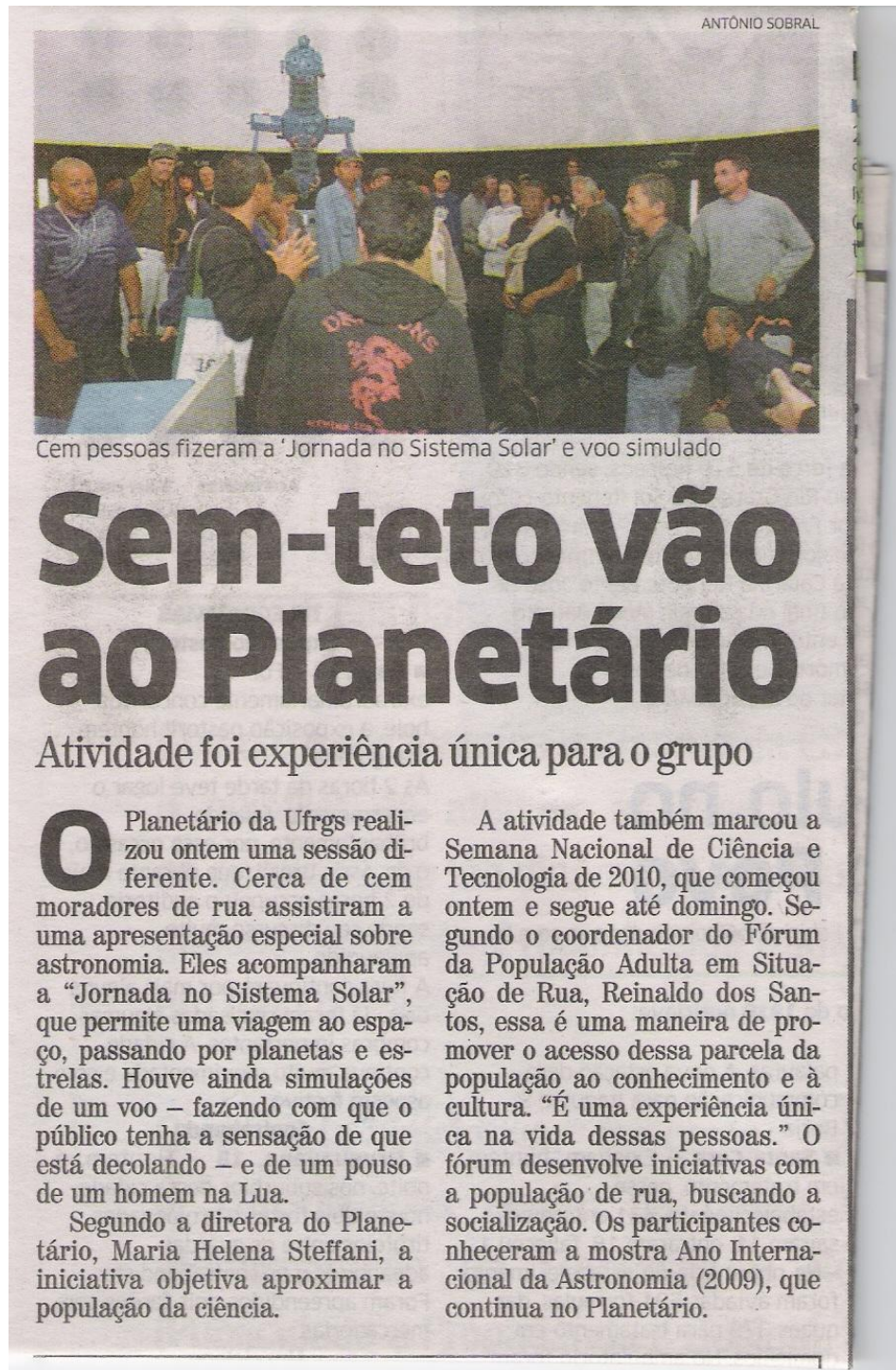
Figure 2: Matter published in the newspaper “Correio do Povo” (19 th October, 2010).